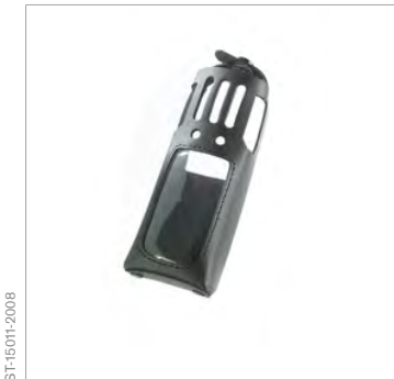
Leather carrying case