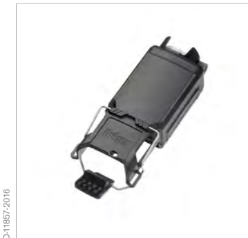
Dräger X-am® 125 external pump

External pump for hose length of up to 45 meters (147 feet). Makes it possible to use the detector for pre-entry measurements into confined spaces such as tanks, shafts, etc. The pump starts automatically when the detector is attached. The change between diffusion and pump operation is quick and easy without any need for additional tools or steps.